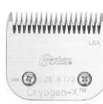
Size 8 1/2 刈高 2.8mm