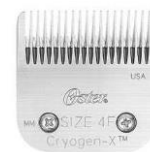
Size 4F 刈高 9.5mm