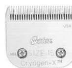
Size 15 刈高 1.2mm