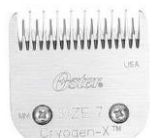
Size 7 Skip Tooth 刈高 3.2mm