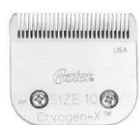
Size 10 刈高 1.6mm