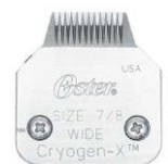
Size 7/8 刈高 0.8mm