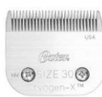
Size 30 刈高 0.5mm