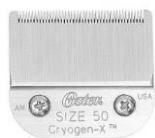
Size 50 刈高 0.2mm