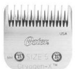
Size 5 Skip Tooth 刈高 6.3mm