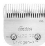
Size 7F 刈高 3.2mm