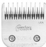
Size 4 Skip Tooth 刈高 9.5mm