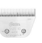
Wide Regular #10 Cut 刈高 1.6mm