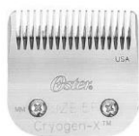
Size 5F 刈高 6.3mm