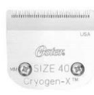
Size 40 刈高 0.25mm