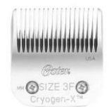
Size 3F 刈高 13mm