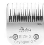
Size 3 刈高 13mm