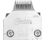
Size 5/8 刈高 0.8mm